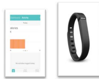
Fig. 2. Fitbit Flex band and app

The Fitbit Flex is an activity and sleep tracking wristband. Data collected can be synced wirelessly to an iOS or Android smartphone or a computer (via a dongle) with Bluetooth 4.0. It tracks steps taken, distance traveled, calories burned, active minutes, hours slept, and quality of sleep. The Flex shows daily progress on the wristband with LED lights and vibration, and shows statistics through charts and tables once the data is synced. Additional features include silent alarms, waterproof design, and sharing with other health and social apps. A picture of the device and the app software is shown in Figure 2.