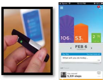
Fig. 1. Jawbone UP24 band and app home screen.

The Jawbone UP24 is a wristband activity tracker that uses accelerometers to automatically track steps walked during the day and amount and quality of sleep at night. Using the Jawbone UP smartphone app, users can view their tracked data, which is synced wirelessly via Bluetooth, and record additional information about diet, mood, workouts, and trends. They can also use the device to provide an idle alert if they want to be reminded to remain physically active throughout the day, wake them up in the morning based on the optimal time in their sleep cycle, or even set a power nap alarm. The only display on the band is the sleep/awake status lights. As seen in Figure 1, a moon icon will light up to indicate sleep mode, and a sun icon will light up to indicate day mode.